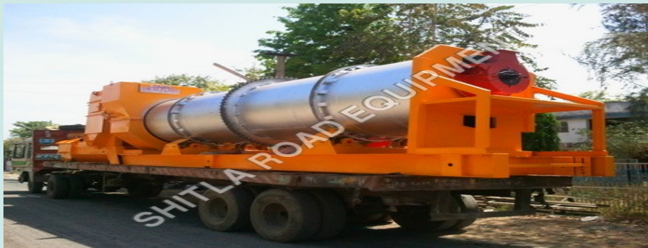
Drum Hot Mix Plant