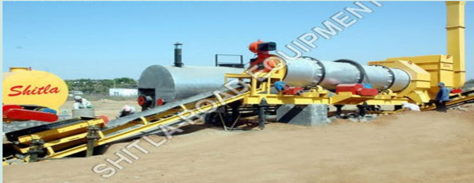
Hot Mix Plant

https://www.facebook.com/shitlaroadequipment